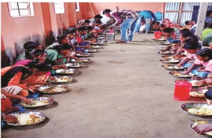
Community Hall & Kitchen