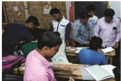
Skill Development Centre